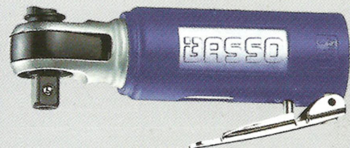
RP102-A1 (Additional feature of wobble anvil and quick release anvil)